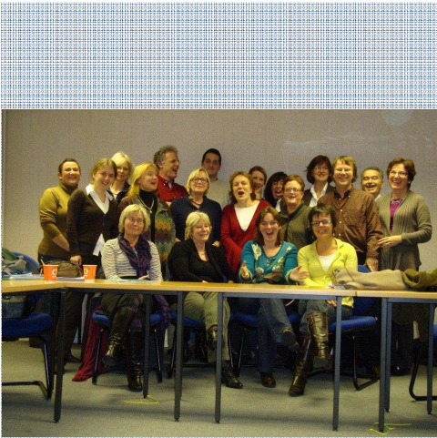
Meeting Bournemouth December 2009